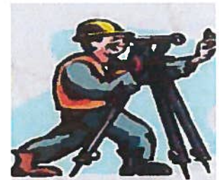
The Practice of Architectural